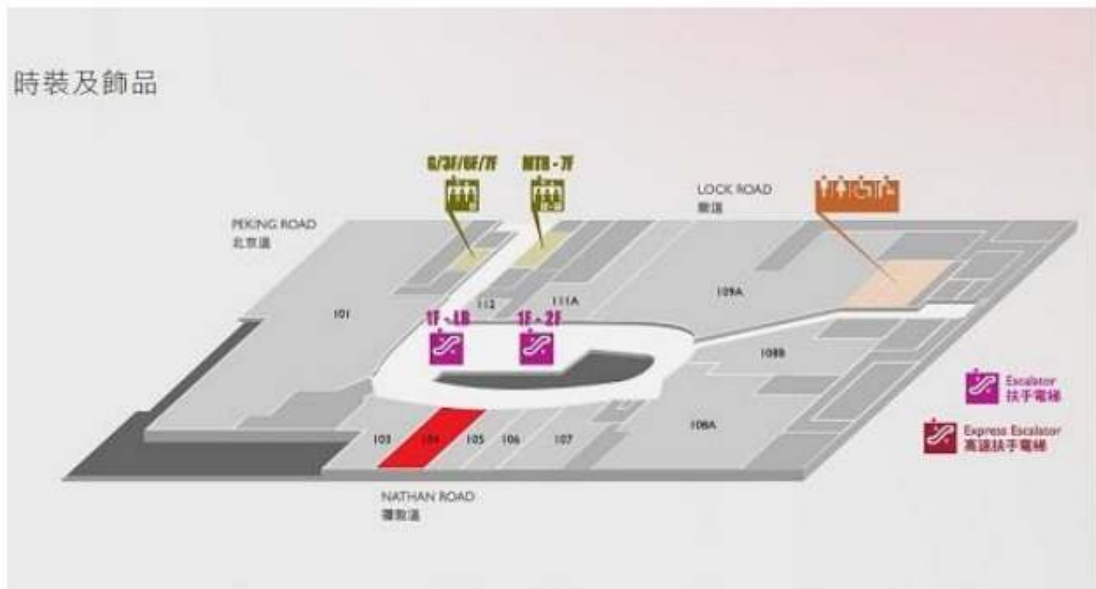
104, 1/F For reference and identification only