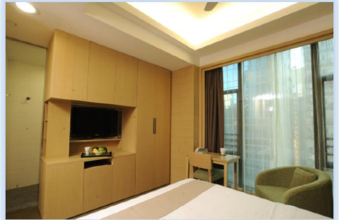
Room01, gross area approx. 350 sq.ft., City-view double bed room, HK$20,000-HK$21,000* net a month