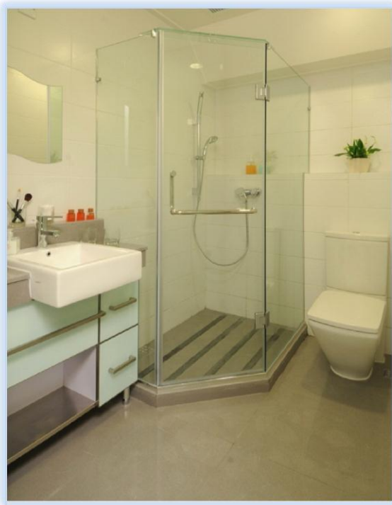
◀ Individual private bathroom