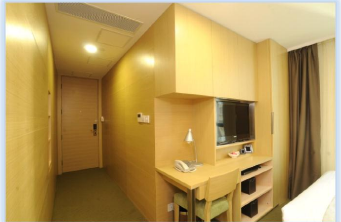
Room02, gross area approx. 270 sq.ft., City-view double bed room, HK$18,000-HK$19,000* net a month