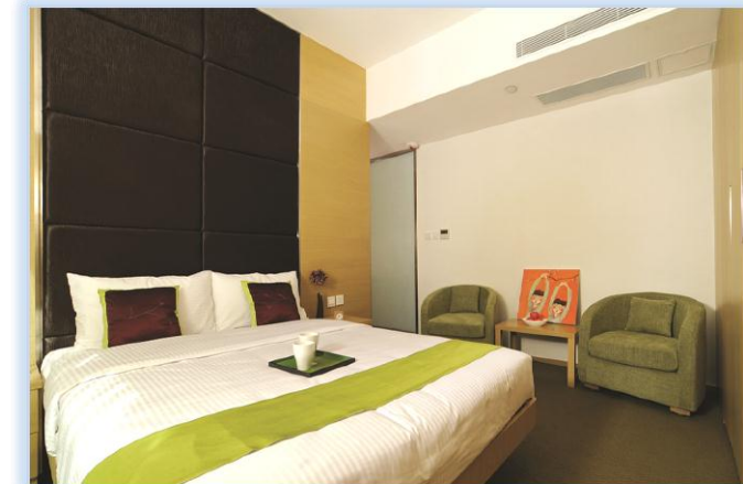
Room03, gross area approx. 360 sq.ft., Sea-view double room, HK$22,000-HK$23,000* net a month