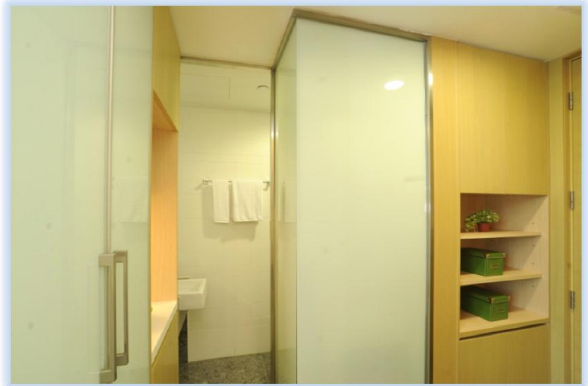
Room04, gross area approx. 240sq.ft., City-view single bed room , HK$15,500-HK$16,500* net a month